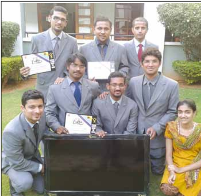
The winning team from XIME at Yukti 2013 organized by Thyagarajar School of Management