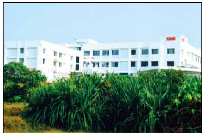
View of the Kochi Campus