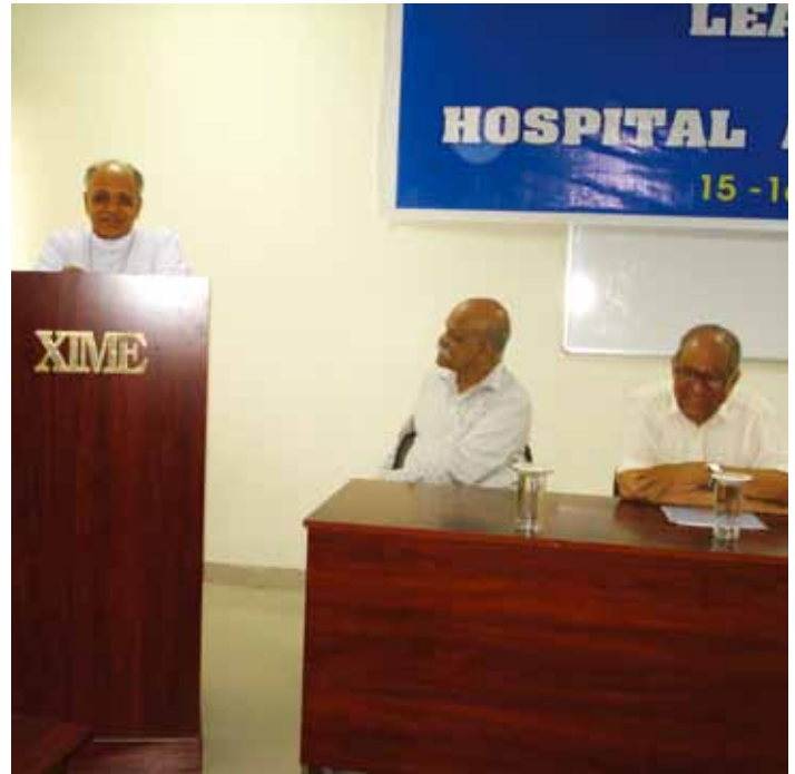
Inaugural session of the Hospital Administrators Summit held at Kochi