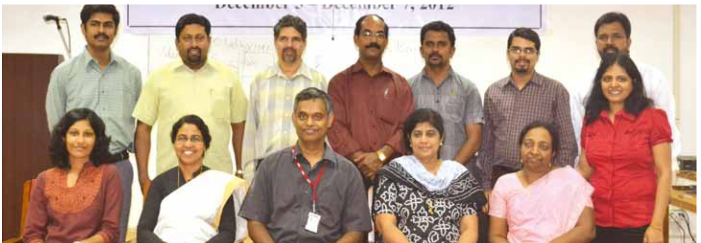
Participants of the MDP on Enhancing Effectiveness of Voluntary Organizations held during 5th - 7th December, 2012