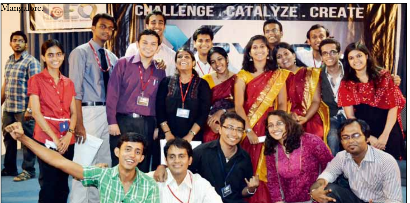
Volunteers during the Inter Xavier B-Schools Fest, XAVION celebrating its success

The fest featured an energetic cultural show which was put up by the students of XIME. It was an excellent display of their varied talents. It showcased a number of dances and songs ranging from fusion to traditional bhangra all of which applauded by the whole crowd. There was a DJ Night towards the end of the two day fiesta that saw the participants of XAVION, let their hair down to enjoy their last night in town.