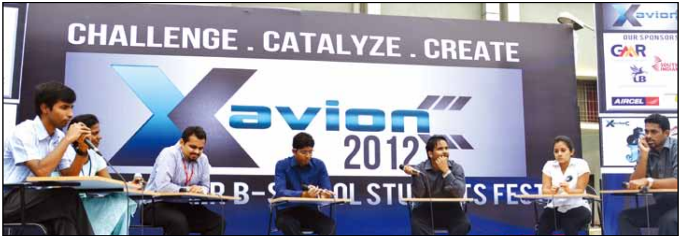
Students participating in the JAM session during the Inter Xavier B-Schools Fest, XAVION

At XIME Bangalore, the weekend of November 23-24 saw heightened levels of activity: XAVION, a two-day fest, organized by XIME, in association with Xavier Association of Management Institutes (XAMI). The participating colleges included XISS Ranchi, XIM Jabalpur, LIBA Chennai, Loyola Academy Hyderabad, St. Aloysius Mangalore, St. Joseph's Bangalore, Mount Carmel Bangalore and St. Joseph's Trichy. The event witnessed many interesting games and competitions, based on different specialisations like HR, Operations, Marketing and Finance as also fun-filled activities that