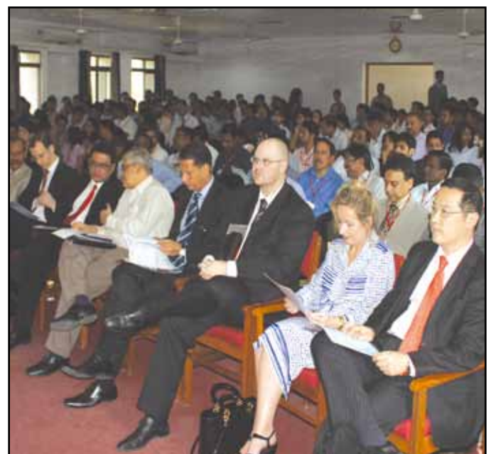
The audience keenly listening to the speakers at the International Labour Law Conference