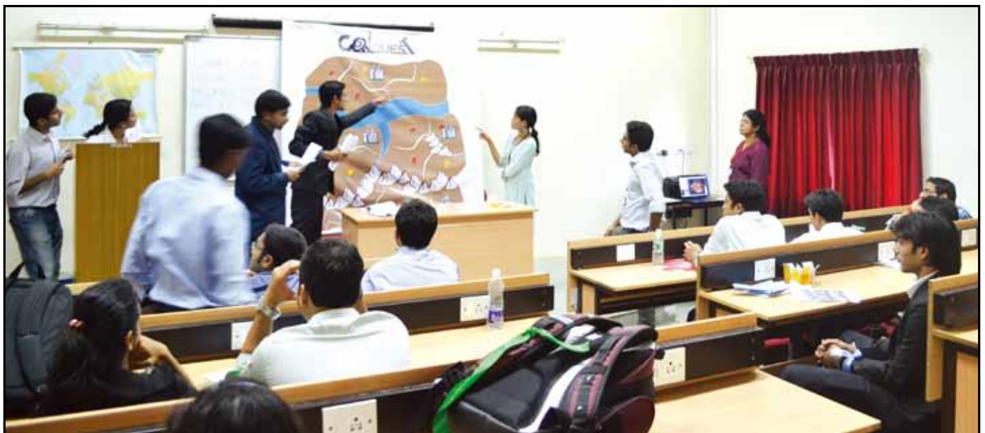
Students participating in the Operations event conducted during the Inter Xavier B-Schools Fest, XAVION

A highlight was the cultural talent that was showcased by students through the Street Play competition. It got all the participants to come up with a fascinating load of ideas based on the theme – Warning Whistle for the Whistle Blowers. The theme was given to the contestants only a few hours in advance and the teams had to come up with an act and present in within a