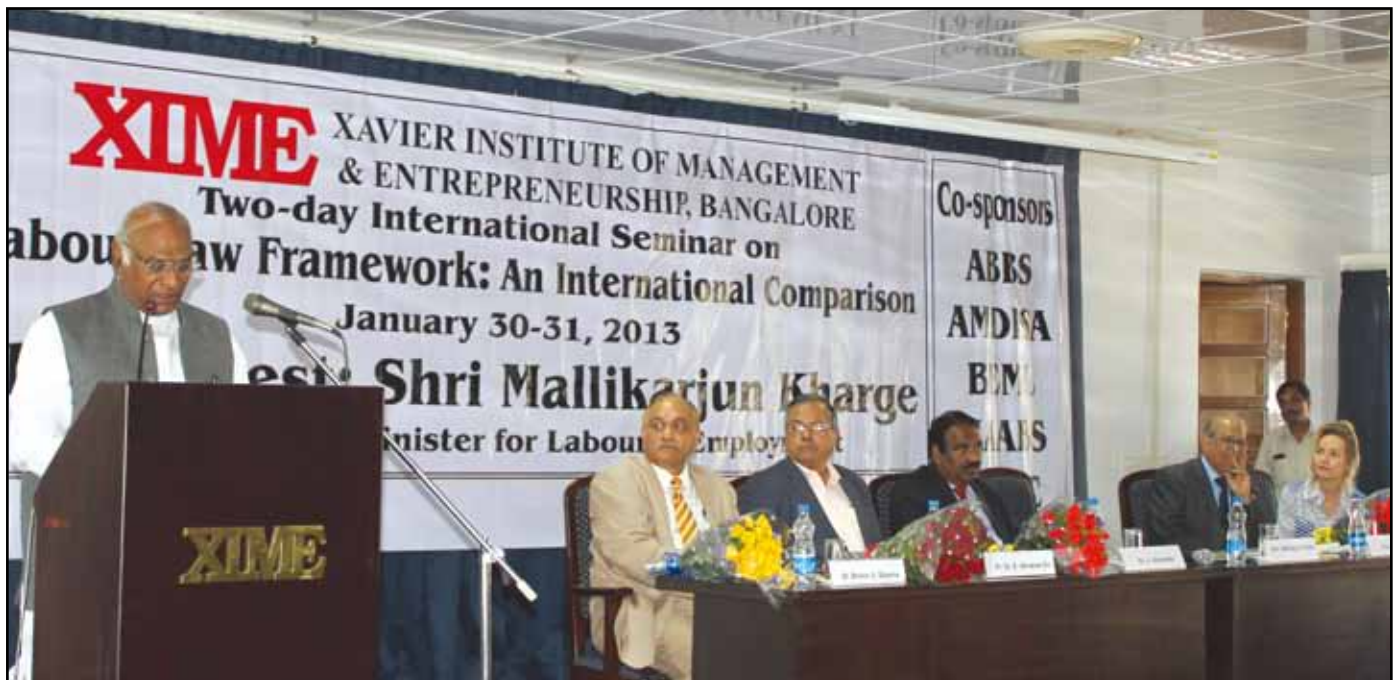
Shri Mallikarjun Kharge, Union Minister of Labour and Employment addressing the gathering during the International Labour Law Conference held in the Bangalore campus of XIME on 30th and 31st January, 2013

The International Labour Law Conference was an intellectually engaging two-day event that took place at XIME, with ABBS, BEM, KAABS, ONGC, AMDISA and XAMI as co-sponsors, on the 30th and 31st of January, 2013. The conference saw thirty professionals from the field of Labour Law from countries as diverse as Germany, China, Japan, Brazil, Malaysia, South Africa, UK and Mexico speaking at the gathering.