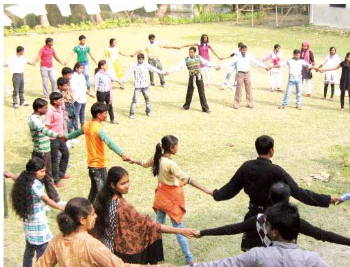
Students participating in the Socially Useful & Productive Activity (SUPA)