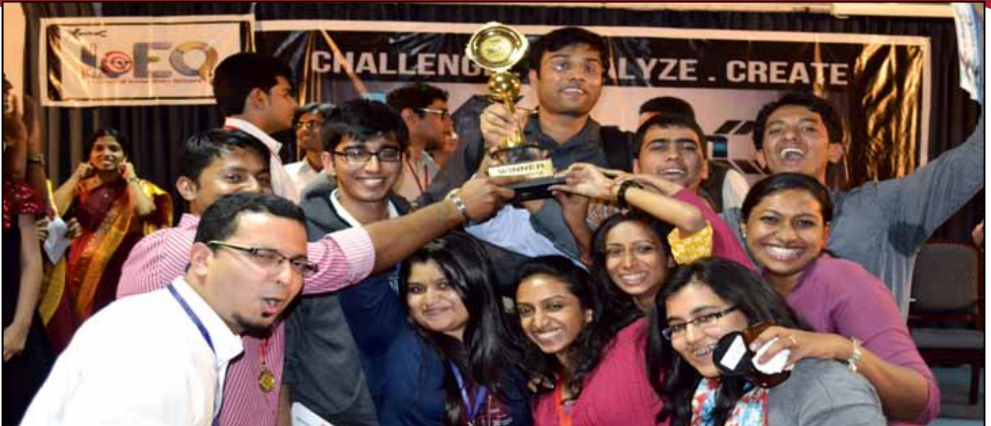
Students of St. Joseph's bagged the Overall Champions Prize at XAVION

short span of time. This however, did not deter them from putting up a great show for the entire crowd. The best show prize was taken away by XIM, Jabalpur.